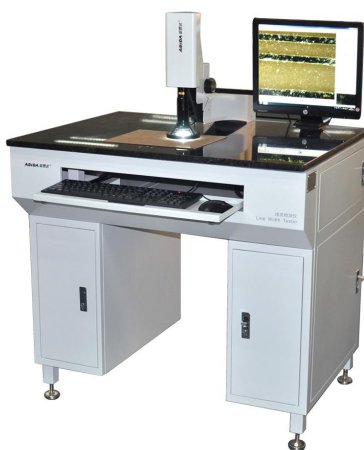
Desk Type XK25